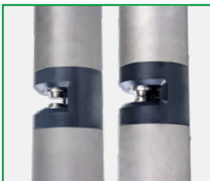
5 mm gap (left) vs. 1 mm gap (right).